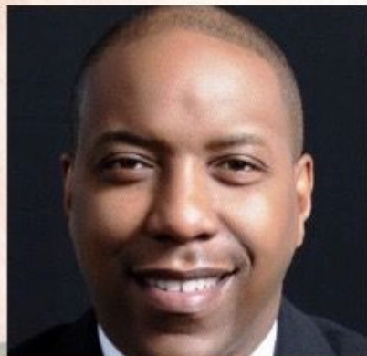
Jamel HOLLEY Assemblyman, NJ-20